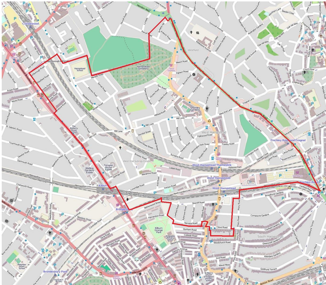
Map 1: Area covered by the Plan

2.2 Historical records show that until the 19 th century the Area was largely rural farmland. It centred on the hamlet of West End, which was within the manor and parish of Hampstead. The arrival of the Midlands Railway in 1871 brought rapid development. The development of the Area from the 1870s to the turn of the 20 th century has given the area a distinctive and attractive appearance – from individual houses, to terraced housing, to mansion blocks, to streetscapes, to the overall image of the Area. The main architectural feature of the Area is the notable red brick Victorian and Edwardian terraces and mansion blocks. These buildings have numerous design features, detailing and characteristics - which are highly valued and appreciated. The Area